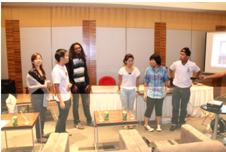
SPY 10 sharing session with the audience

SIS welcomed her newest members into the alumni on the occasion of the 15 th Biennial General Meeting on 15 th January 2011 at Singtel Recreation Club. The SPYs were then invited to share their personal experiences during the programme. All guests enjoyed themselves with good food and a karaoke session.