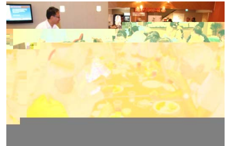
Enjoying the good food