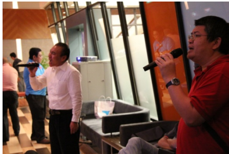
Future SSEAYP Idols???