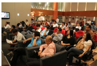
Members listening attentively to the procedures of the BGM